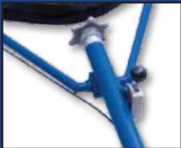
Adjustable handle design