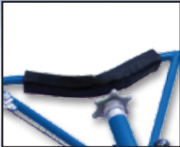
Padded hip bar